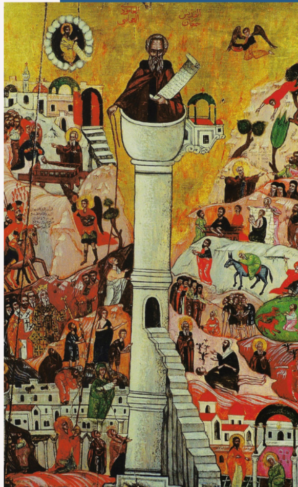
Saint Simeon the Stylite